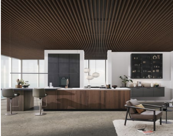
LEICHT looks to the future, illustrating a living space opened up to the full and featuring visible functional zones.