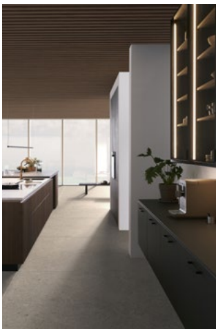
Architecture with vision: the residents enjoy scope for personal development in the room open on all sides.