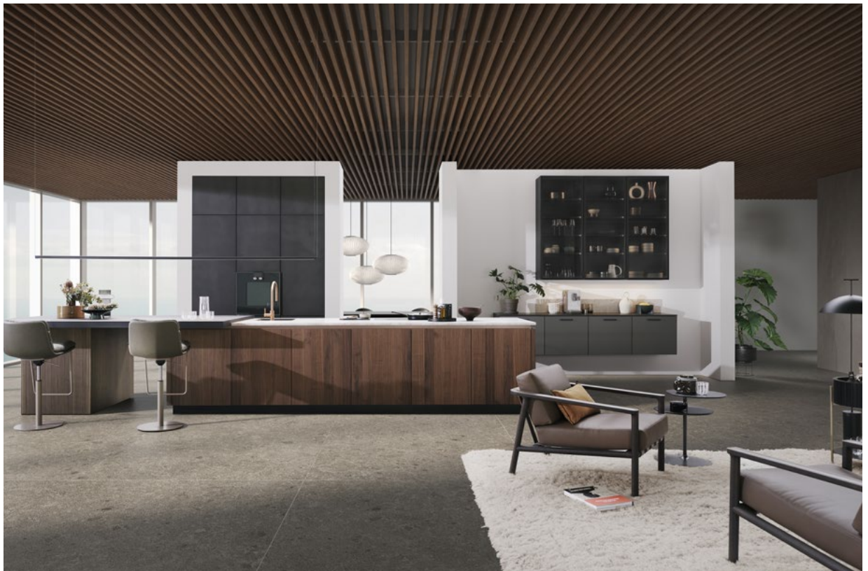
The combination of the LEICHT programmes BOSSA walnut, ROCCA taj mahal sanded and CONCRETE brasilia results in a harmonious material and colour composition.

In the centre, conceived as the hub of family life, this kitchen features a handle-less island block with an integrated seating area which is given a special structure all round by the successful real wood surface programme BOSSA in walnut. The protruding, linear ridges of the multi-award-winning BOSSA front create a warm-looking, uniform appearance and give the kitchen a three-dimensional, extremely vital look – a deliberate planning decision to create an elegant but also vital effect. In combination with a natural stone worktop from the LEICHT programme ROCCA, and self-contained wall elements behind it with integrated functional and living areas, the result is a visionary scenario that relies on durable, quality materials on the one hand and conveys a feeling of home on the other.