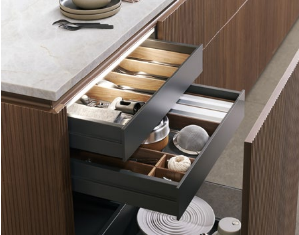
Inside the island units, the M8 interior frame in carbon grey continues the high-quality, minimalist overall appearance with its clear, reduced design.