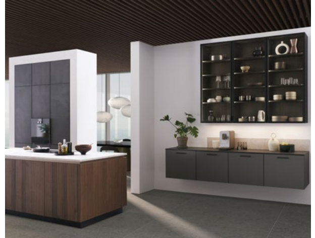
The two wall elements positioned freely within the room provide structure: on the left, a functional tall unit; on the right, homely furniture.