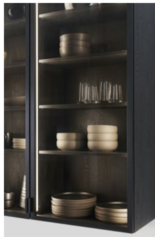
The illuminated VERO glass display cabinets are perfect for beautifully showcasing fine crockery and decorative accessories.