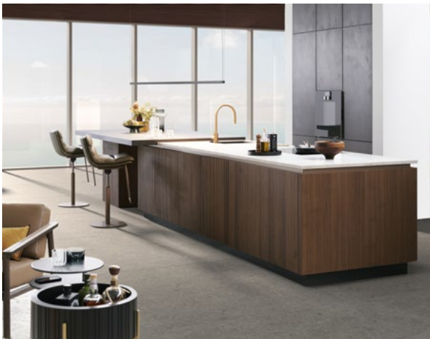
The centrally positioned island with real wood cladding in BOSSA walnut is the social focus of everyday living in this scenario.