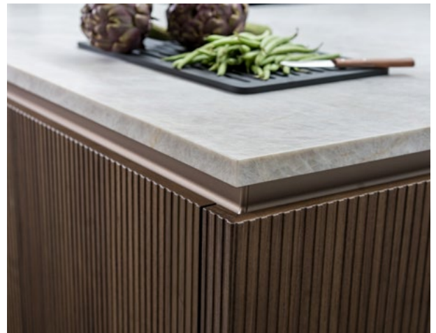
Harmonious material composition: while BOSSA in walnut radiates warmth, the natural stone ROCCA in taj mahal sanded adds some balancing coolness.